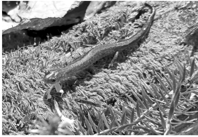
While hunting for morels recently I came across this adorable red-backed salamander. Red-backs, along with their gray phase known as lead-backs, are Michigan's most common salamander species. Salamanders are also the most plentiful vertebrate animal in Michigan's forests, found in considerably larger densities than birds, snakes or squirrels!