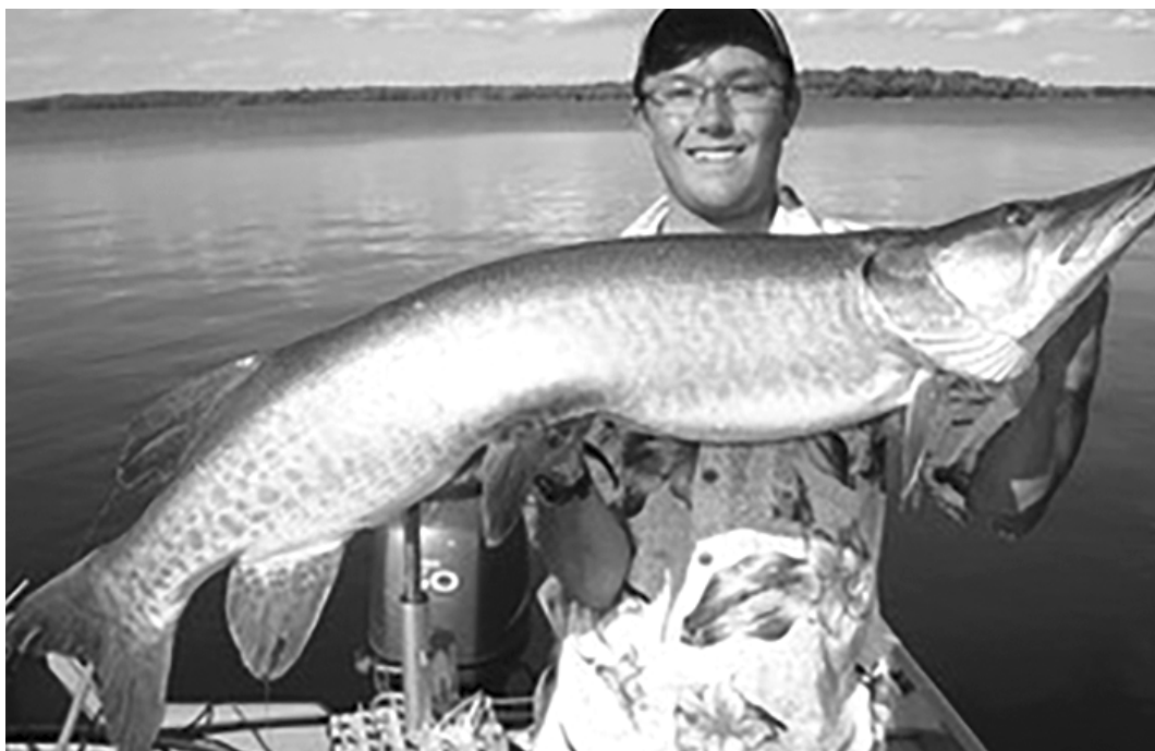
Anglers are asked to report muskellunge and lake sturgeon this season.

The same process is now in place for lake sturgeon, too, although no fishing and/or possession seasons open for that species until July 16. The lake sturgeon fishing permit and harvest tags are no longer